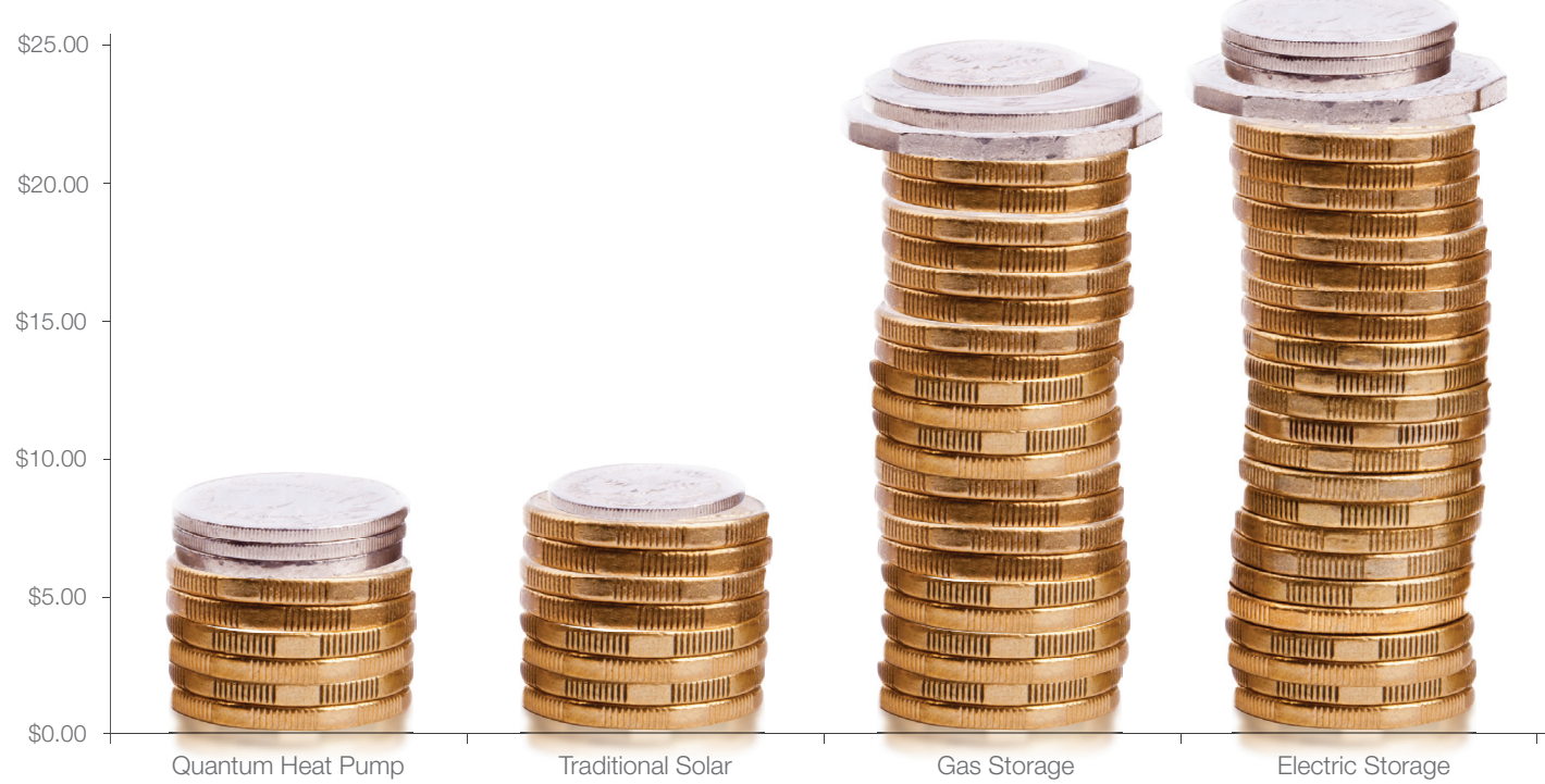
Weekly Running Cost