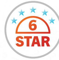
6 Star energy efficiency