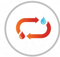
Hot water that never runs out