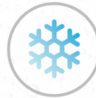
Frost protection system