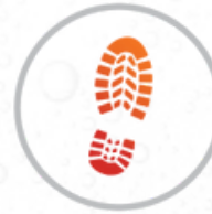
Small footprint saving space