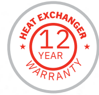
12 year heat exchanger warranty