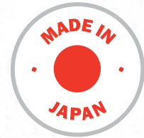
Made in Japan